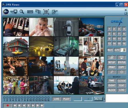
Orbix Software Client Interface

The advanced standalone Orbix H264 security DVRs incorporate an embedded operating system with on-screen multilingual display (OSD) menu, audio and alarm inputs, user selectable composite or VGA video output, and stores video using the latest H264 compression code/decode (codec) format. It has a user selectable image capture rate and video resolution and can hold up to three internal disk drives (SATA interface). A built-in web server allows remote internet viewing using MS Internet Explorer 5.0 or greater. Free downloadable software allows programming and advanced DVR control during remote viewing using the Orbix client interface.