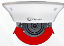
90° Lens Angle Adjustment