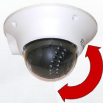
120° Vertical Camera Angle Adjustment