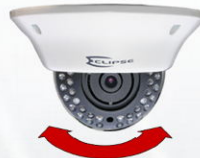
360° Horizontal Camera Angle Adjustment